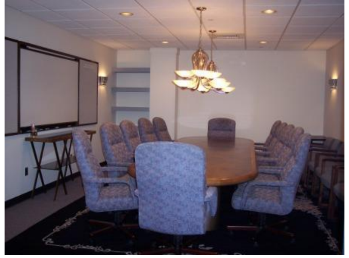
Suites Conference Room